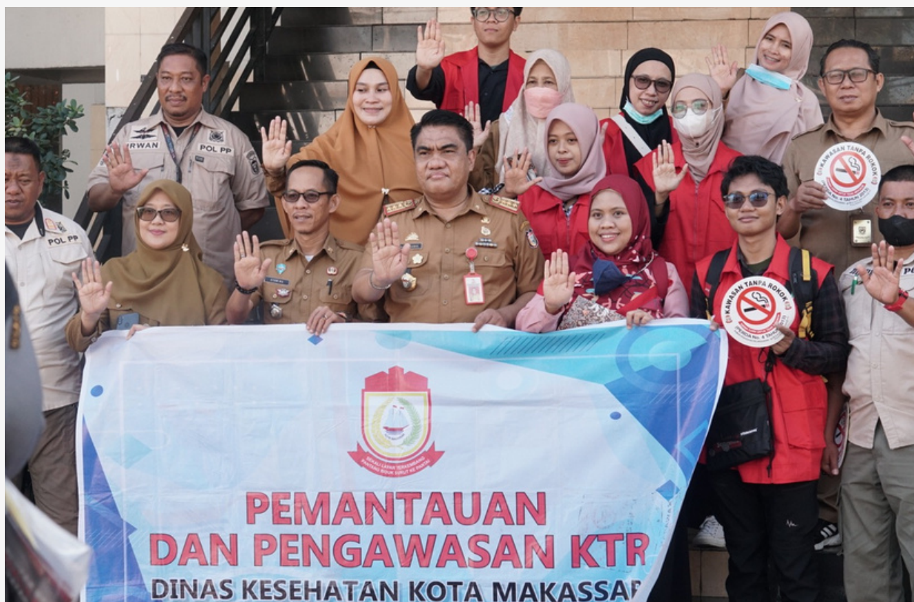
Picture 14: Random Inspection to monitor smokefree implementation led by Assistant Mayor in Makassar City