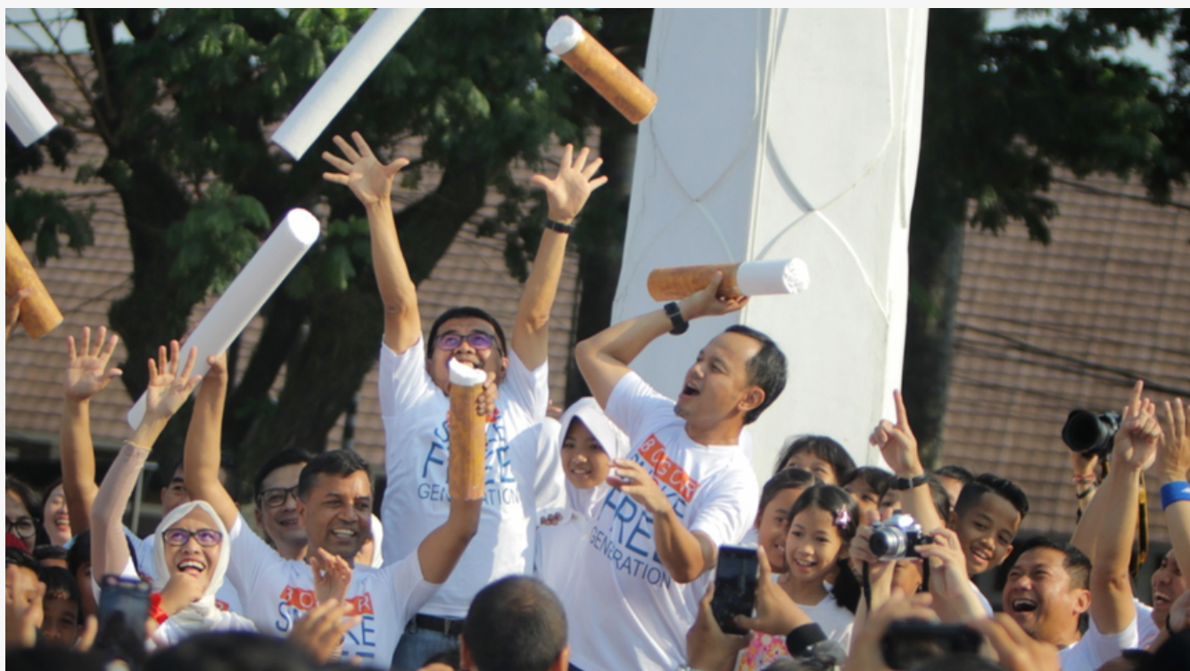
Picture 11: Chair of Asia Pacific Cities Alliance for Health and Development (APCAT) and Mayor of Bogor City Dr. Bima Arya at smokefree public campaign

If the process to put a policy, structure, or resource in place is underway at the time of the assessment it should be considered ‘absent’ until the policy, resource, or structure is formally in place. In this way, an ITCS assessment should be viewed as a ‘snapshot in time’, capturing a moment in an evolving situation. Repeat assessments can be useful for gauging progress over time.