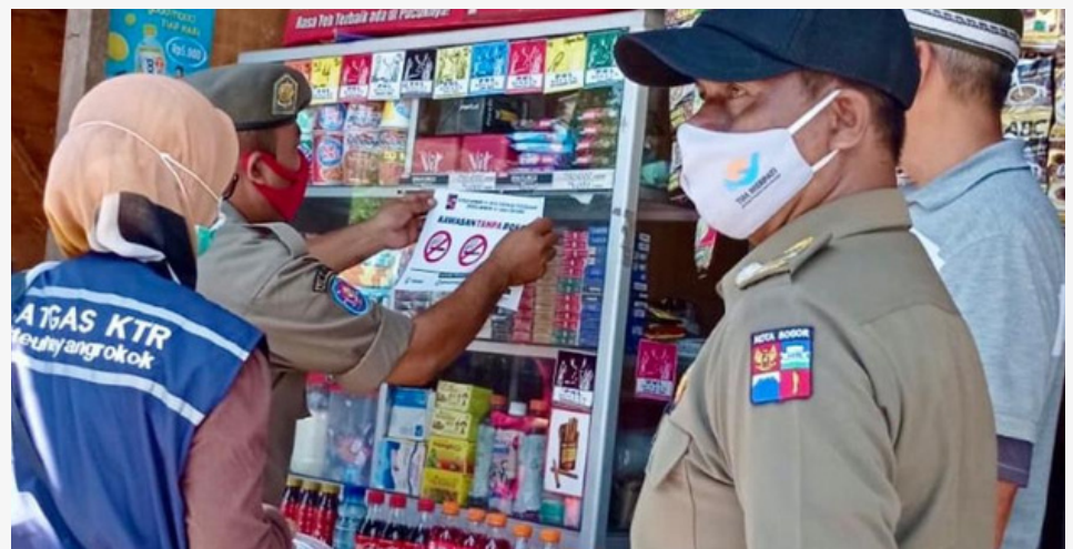
Picture 8: Random monitoring of implementation of smokefree and ban display of tobacco products at the POS in Bogor City

The city/district has assigned a government staff with specific responsibility for leading and coordinating tobacco control in the city.