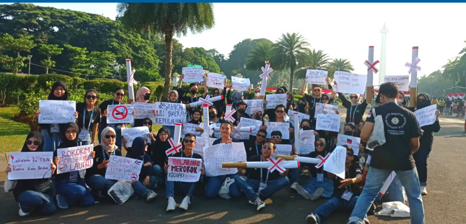
Picture 1: Campaign for stronger tobacco control in Indonesia, led by young adults.

A TOOL TO MEASURE THE SUSTAINABILITY OF TOBACCO CONTROL PROGRAMS IN CITIES/DISTRICTS OF INDONESIA