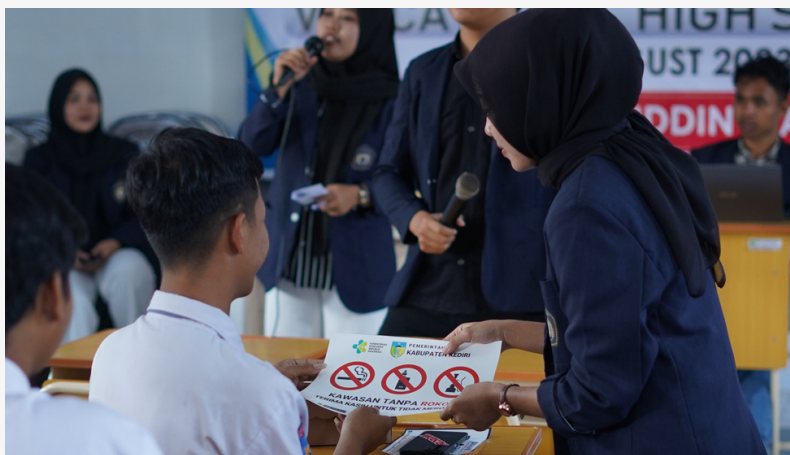
Picture 2: Youth for tobacco control policy to ban smoking, e-cigarettes, and other tobacco products