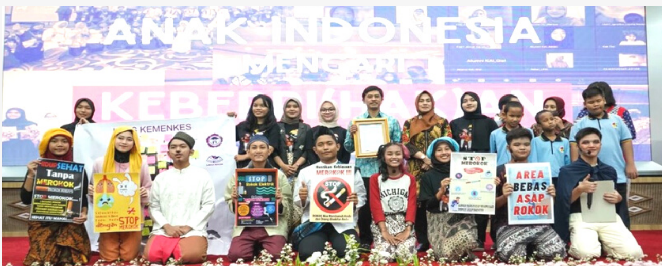
Picture 12: Vice Minister, Ministry of Health Indonesia with youths at commemoration of World No Tobacco Day 2023

As provinces, cities, and districts complete assessments over time, achievements can be reported across media, which also helps build awareness for and support of national efforts to reduce tobacco use and protect and promote health. We recommend you complete an assessment yearly to track progress towards sustainability.