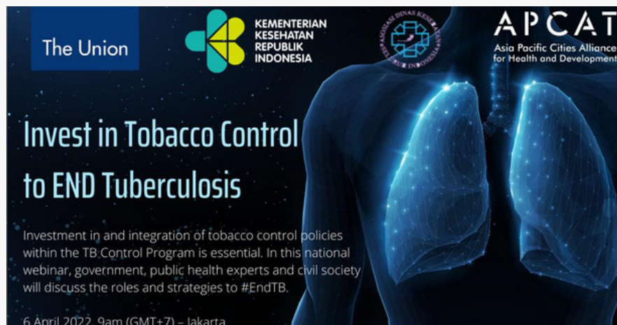
Picture 6: Poster for "Invest in Tobacco Control to END Tuberculosis" webinar

The city/district has incorporated tobacco control measures into programs to protect from negative environmental impacts.