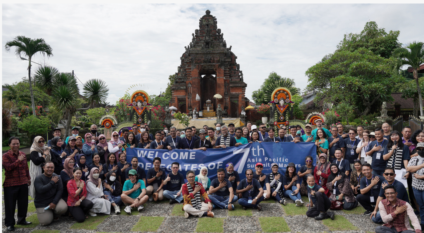
Picture 10: Participants of 7th APCAT Summit during field trip to Klungkung district in Bali to observe implementation of smokefree and ban tobacco advertising

The city/district collaborates with local universities to generate local evidences to support tobacco control policies and programs.